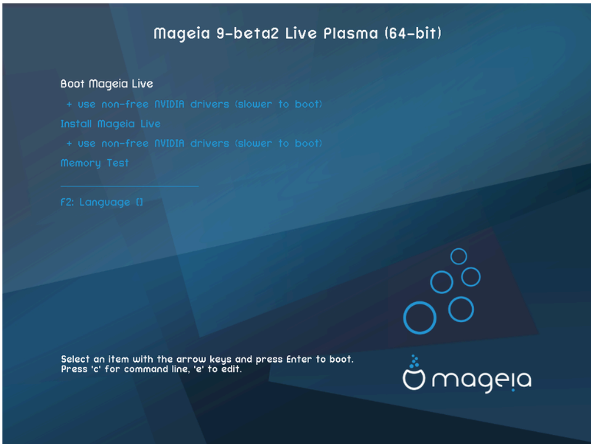
First screen while booting in BIOS mode